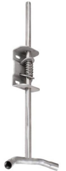
双头可调节饮水杆 Double-end Adjustable Drinking Lever 尺寸/Dimension: L=64mm 重量/Weight: 1564g