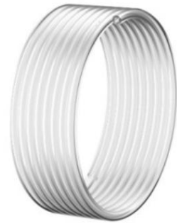
气管 材料/Material: PU; PE 直径/Diameter: Φ10; Φ12