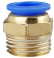
外丝铜接头 PC10-04直径Φ10 PC12-04直径Φ12