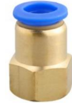
内丝铜接头 PCF10-04: 直径Φ10, 4分管 PCF12-04: 直径Φ12, 4分管